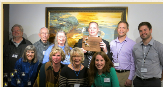
Bone Creek was the NEBRASKAland Foundation's Rising Star in 2016