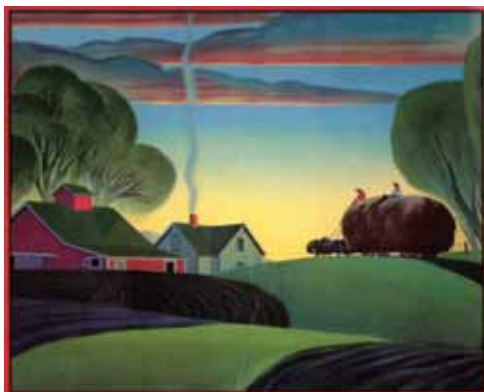
Dale Nichols, When Day is Done , 1951, Gold Seal Puzzle, Private Collection Loan

575 E Street, David City, NE 68632 402.367.4488 www.bonecreek.org