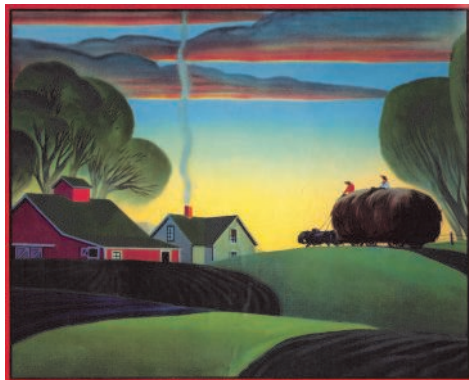
Dale Nichols, When Day is Done , 1951, Gold Seal Puzzle, Private Collection Loan.

575 E Street, David City, Nebraska 68632 402.367.4488, www.bonecreek.org