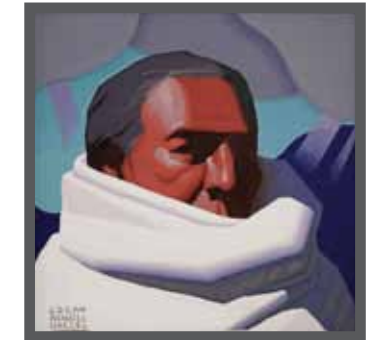
Providing Rain, oil, 12x12

celebrate humanity’s connection to the land in fine art.