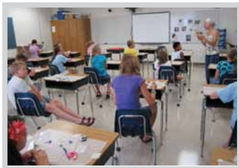
Sculpture class at Art Day Camp 2012