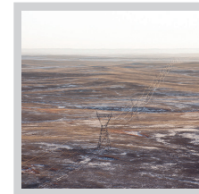
WAPA power lines, 2015

Her uncle helped facilitate the aerial photos in his personal plane. Those aerial views make humanity seem so small amidst the expansive landscape. The wide open spaces and no