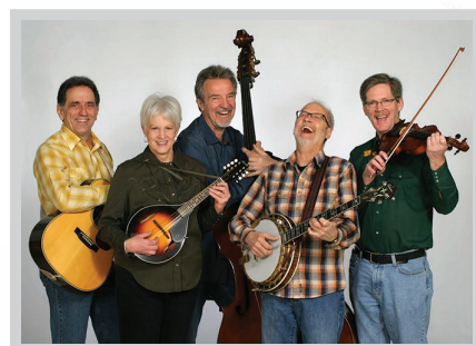
The Toasted Ponies

Visit bonecreek.org to become a member or make a tax-deductible donation.