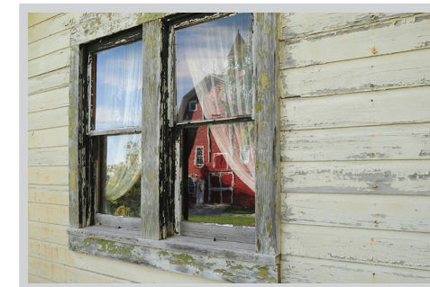
Angela Carroll, Through the Window , photograph

“Many artworks submitted for this exhibition are unique and intriguing, but I am particularly impressed with some of the photographic images we received. Through the Window by Angela Carroll instantly caught my attention. The image of the large red barn has consistently symbolized the ideal farm, but in Carroll's photograph, the reflection of the icon is framed in the worn window of an old farm structure, which pays tribute to the generations of laborers who forged the farming tradition.”