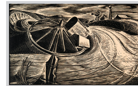
Dwight Kirsch, RFD Nebraska , woodcut print

“Dwight Kirsch (1889-1981) is the only deceased artist represented in 150 for Nebraska's 150th. I was glad to be able to accept the request that a print by Kirsch be included in the show and sale. Kirsch had a strong influence on the arts in Nebraska as an artist, teacher, and administrator who purchased many modern artworks that formed the basis of the Sheldon Museum of Art's collection. This is a surrealist depiction of a road, farm and mailbox. Rural free delivery began in the US in 1896 serving farm families with an increased ease of communication.”