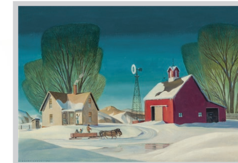
"Winter on the Farm," 1969, Sold for $62,500