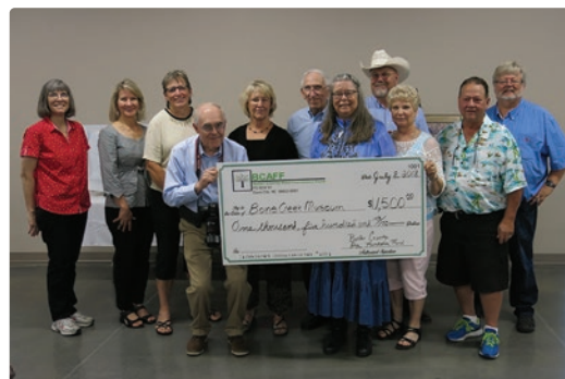
Members of the Bone Creek board are presented with check from the Butler County Area Foundation Fund