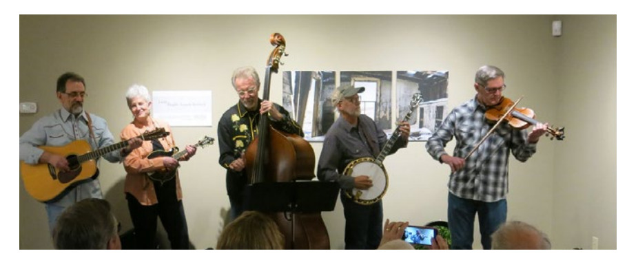
The Toasted Ponies brought outstanding bluegrass music to David Place, St. Joseph's Villa and to Bone Creek Museum of Agrarian Art the afternoon of Sunday, March 26, 2017.

Events sponsored by the Butler County Arts Council are supported by the Nebraska Arts Council, a state agency, through its matching grants program funded by the Nebraska Legislature, the National Endowment for the Arts and the Nebraska Cultural Endowment.