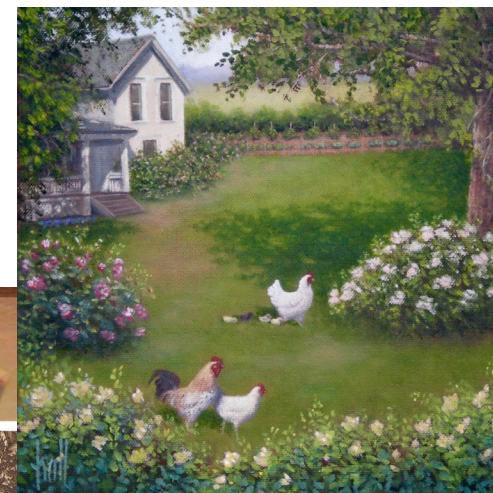
Wendy Hall, "Gardens and Chickens," 10x10" oil on canvas