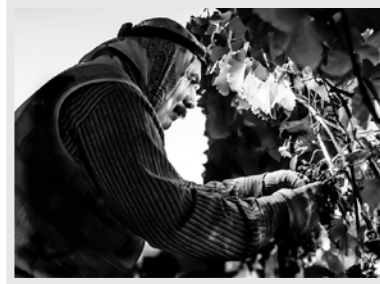
Andrew Lincoln, "Armando Reyes," 16x20", Photograph

For updates on community events and classes, follow Bone Creek Museum on Facebook or visit our website at bonecreek.org/education .