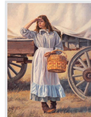
David Graham, Pioneer Spirit , 2022, Oil on panel, 12” x 9”