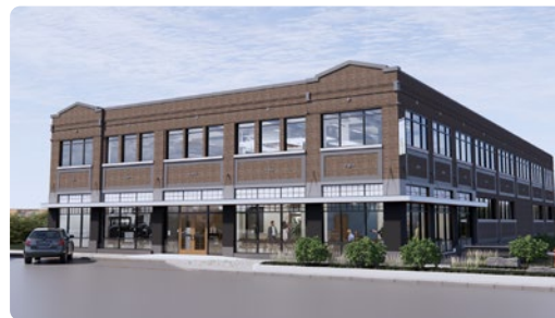
Rendering of the exterior of Ford Building

Engraved tribute bricks are still available for purchase for the renovation of the Ford Building. Each brick will be engraved with two lines of text of your choosing. $150 each. Order at bonecreek.org .