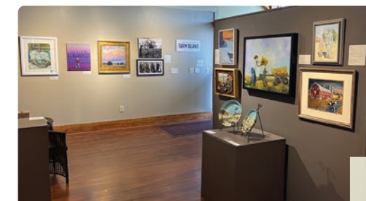
Gallery View of Farm Island Anthology

On exhibition at the Education Center of the Homestead National Monument in Beatrice, Nebr. through Aug. 28, 2023, this collection explores the themes of life and culture on the overland trail.